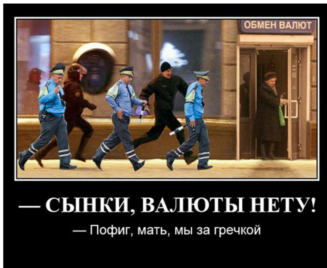
FIGURE 4 An example of the internet meme that plays on shortages of foreign currency and deficit of buckwheat in 2011 in Belarus. http://kyky.org/life/istoriya-belorusskoy-valyutnoy-fotozhaby

a superimposed images of the head of the Union of Writers, M. Charhinets. Access to the blog was temporarily blocked and he faced criminal charges for desecrating a flag, which were later dropped. One of the motives behind the prank stemmed from the fact that Charhinets, as the head of Public Morality Council, considered banning Rammstein's performance in Minsk (Khvoin 2012).