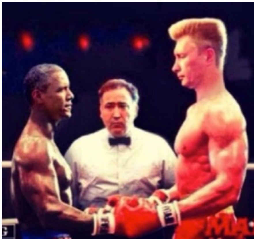
FIGURE 1 An example of the internet meme that compares Vladimir Putin and Barack Obama to characters of Rocky IV (1985)