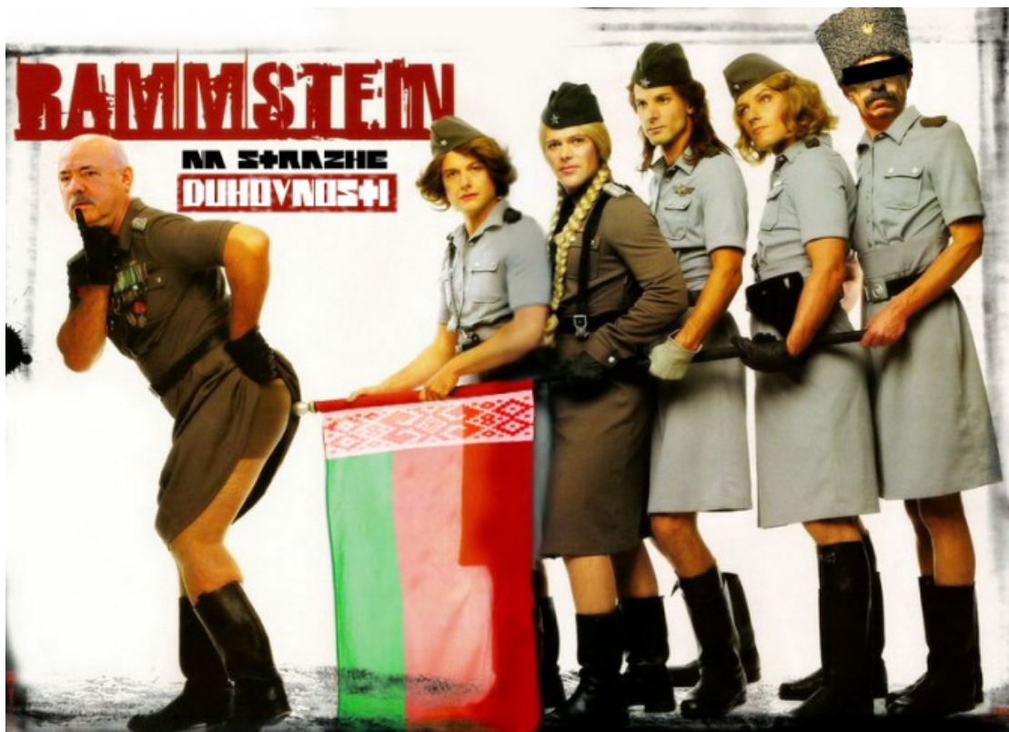
FIGURE 3 An example of the internet meme that uses a Rammstein album cover. POSTED ON LIPKOVICH'S BLOG, 2011 ( http://lipkovicha.livejournal.com/ )

Nevertheless, subversive tactics online can be employed by various actors. Similar to the Crimean incident, also in Belarus, Internet memes have become one of the wider spread non-hegemonic tactics due to the ease and relative safety of their production and dissemination. The circulation of these online grassroots satirical images explicates the difficulties involved in controlling information flows online. This is partially due to the impossibility of exerting control over “multiple” readings of the satirical messages. Three examples below contextualize challenges to authoritarian governments seeking to maintain control over media output and reception.