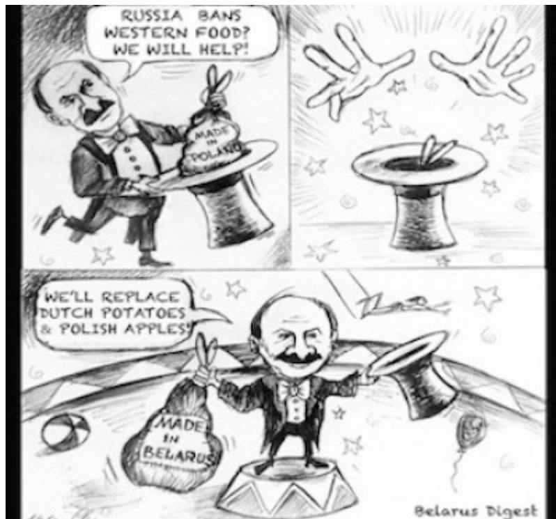
FIGURE 5 An ironical illustration of how Belarus supports Russia after Russian food embargo of certain western food.