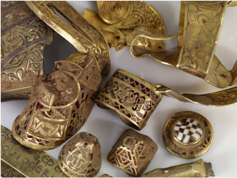
A group of soil-encrusted objects from the Hoard. 99x75mm (300 x 300 DPI)