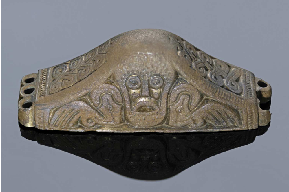
Could an aged silver pommel (StH 711), probably made on the Continent, represent elite identity claims among the Angles or Saxons? Length: 48.1mm. 77x51mm (300 x 300 DPI)