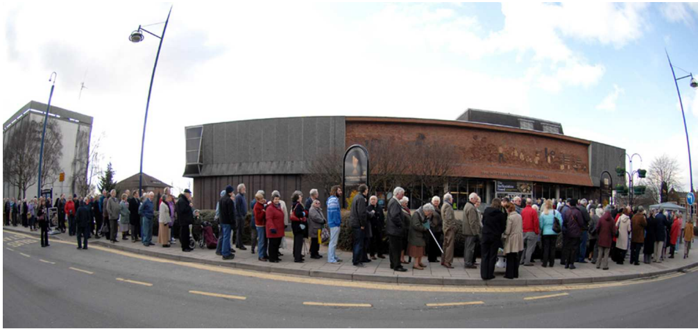
Public interest in the Hoard created long queues outside the Potteries Museum when it was first displayed. 119x56mm (300 x 300 DPI)